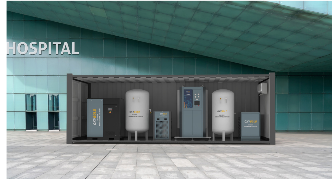
Medical Oxygen Generating System placed outside of a hospital